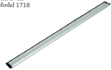
Model 1712 & Model 1718