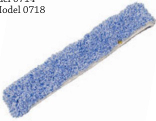
Model 0714 & Model 0718

All weights and specifications are approximate.