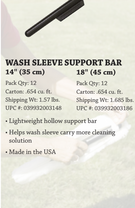
Model 0314 & Model 0318