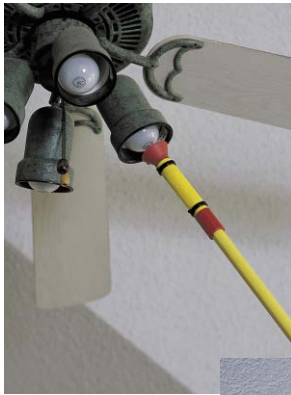
Standard-shaped incandescent and LED bulbs.