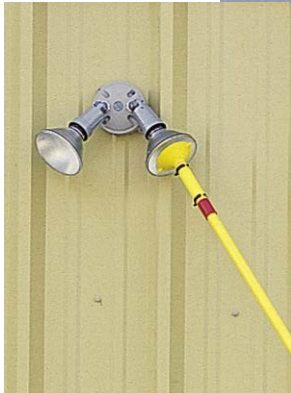
Smooth-faced floodlight bulbs.